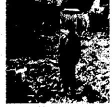
To Rebuild, Japanese Town Must First Survive

Home | World | U.S. | N.Y. / Region | Business | Technology | Science | Health | Sports | Opinion | Arts | Style | Travel | Jobs | Real Estate | Automobiles | Back to Top Copyright 2010 The New York Times Company | Privacy Policy | Terms of Service | Search | Corrections | RSS | First Look | Help | Contact Us | Work for Us | Site Map