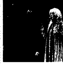
'A Celebration of Kate McGarrigle' at Town Hall