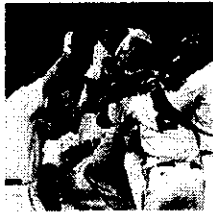
Ahead of Schedule, Indians Rock Again