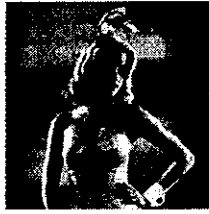
Networks Strive for Fresh Ideas for Fall Season